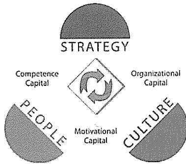
Figure 1: The Foundation of Effective Strategy Execution

Organizations have at their disposal three types of "capital" to support strategy. If all three are not in harmony, execution is compromised. Employee assessment and the resulting "snapshot" of your organization's culture can be used to ensure that people with the needed skills are available (competence capital), that they are motivated in ways they value (motivational capital), and that the organization's internal structure supports the entire effort to execute on strategy (organizational capital).